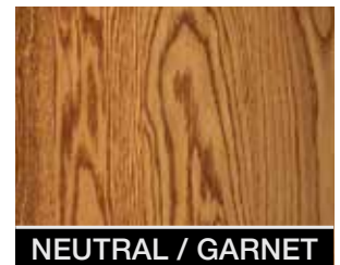
NEUTRAL / GARNET