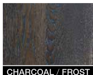
CHARCOAL / FROST