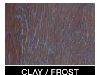
CLAY / FROST