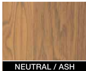
NEUTRAL / ASH