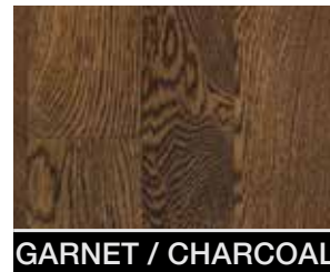
GARNET / CHARCOAL