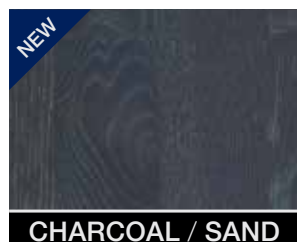
CHARCOAL / SAND