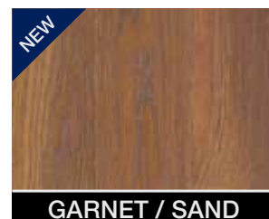
GARNET / SAND