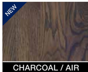
CHARCOAL / AIR