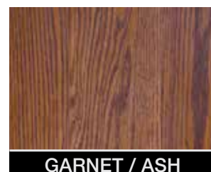
GARNET / ASH