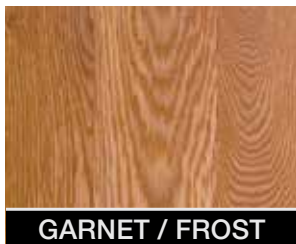
GARNET / FROST