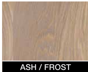
ASH / FROST