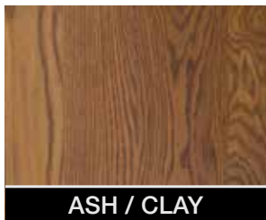
ASH / CLAY