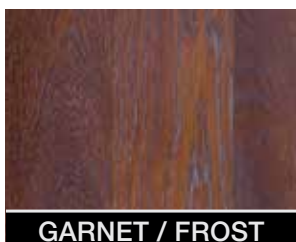
GARNET / FROST