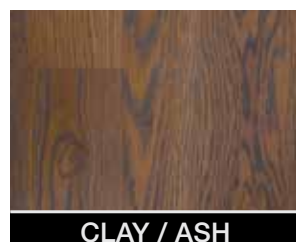
CLAY / ASH