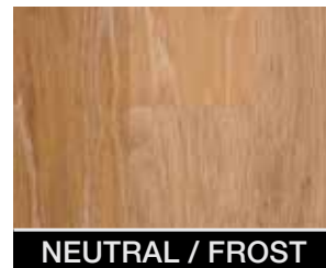
NEUTRAL / FROST