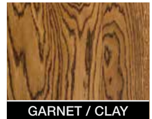
GARNET / CLAY