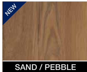
SAND / PEBBLE