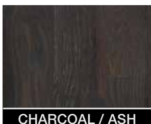
CHARCOAL / ASH